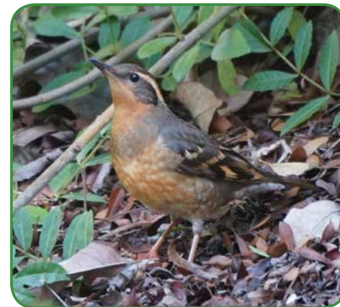
Varied Thrush

Cathy and Jim's bird feeder at the top of the hill in Rolling Hills attracts many birds not often seen elsewhere in the area. A Varied Thrush visited them on CBC day (Dec. 23). They had the lone White-throated Sparrow this