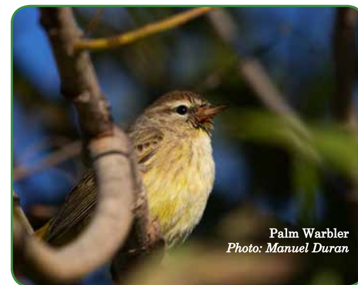
Palm Warbler

The female Black and White Warbler continued at Madrona Marsh for the ninth winter; it was joined by a male on Dec. 5 (Jeanne Bellemin, Melody Houghton). Another Black-and-White continued at Wilderness Park through the end of January. The Palm Warbler wintering at Avila Park adjacent to the L.A.