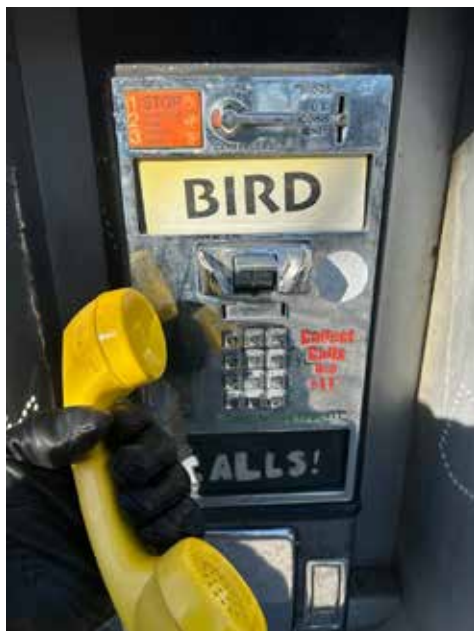
Bird call phone