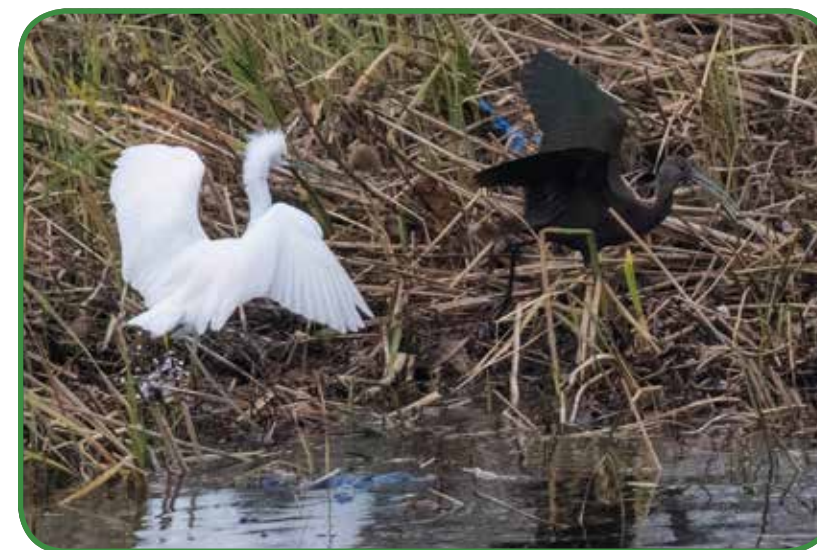
Snowy Egret and White-faced Ibis