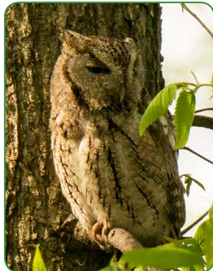
Eastern Screech Owl

“Alfie and Me” is one of those rare books that captures the imagination of all who read it. Written by celebrated author and scientist Carl Safina, this book is an unusual memoir that lies at the unexpected intersection of owls and Covid-19. In it, we find a record of how a scientist who knows birds well, takes into his care a doomed nestling Eastern Screech Owl and discovers that, given the time and patience to observe carefully—and with a good deal of luck, just how much more there is to know