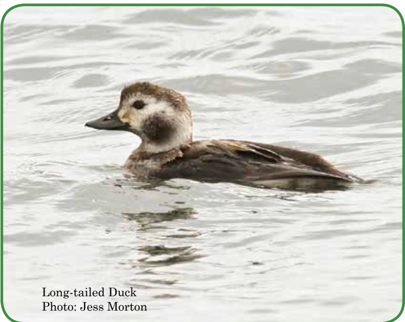
Long-tailed Duck