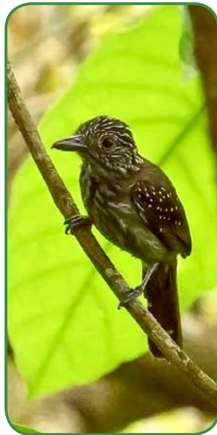
Black-hooded Antshrike

Contrary to what one might expect, there are parts of the Amazon basin where dozens of antbird species coexist. This is possible because most antbirds tend to be highly specialized, often being very particular about where they feed. This allows mixed flocks of birds to